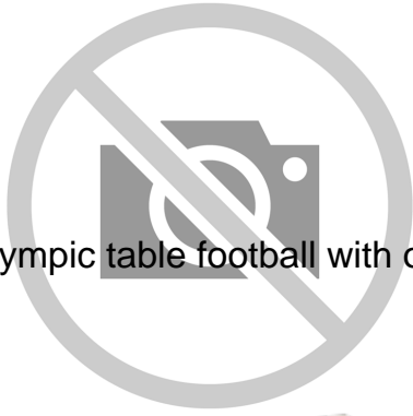
Garlando Olympic table football with outgoing rods